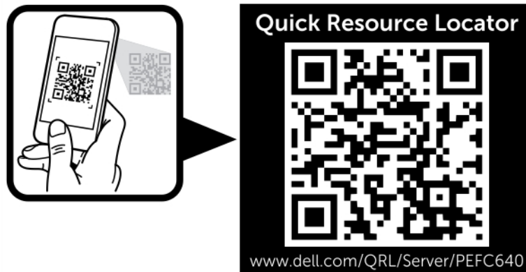
Figure 2. Quick Resource Locator for the PowerEdge FC640