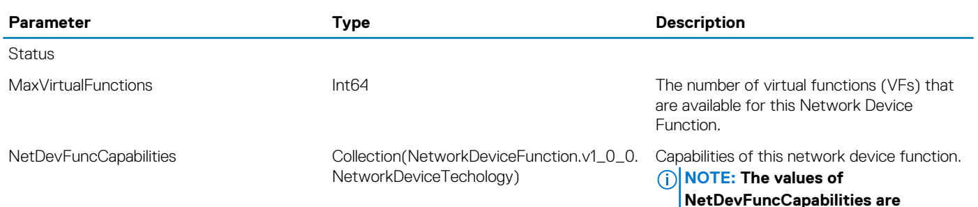
Table 144. Parameters for NetworkDeviceFunction Settings