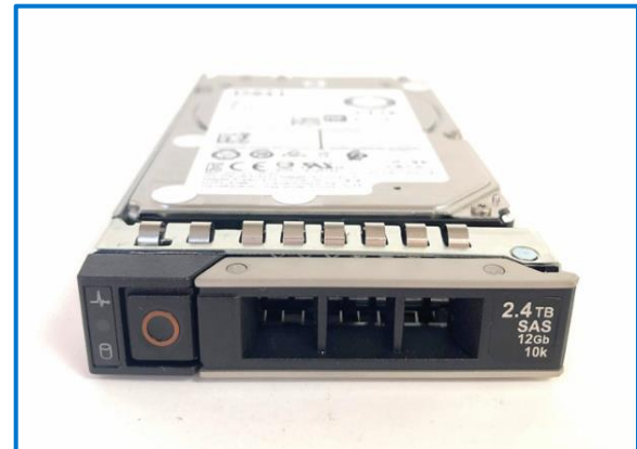
Figure 1: Agnostic (Dell Branded) SSD

The underlying concept is that without an agnostic choice to select, customers may be subject to trade-offs associated with a specific brand, such as prolonged lead times or premium pricing. By purchasing a large pool of SSD hardware from approved vendors, Dell EMC can provide a drive configuration with minimal trade-offs. The primary drawback of agnostic is that customers can't pick the exact drive brand they want. However, this strategy is advantageous for the 65% of customers who do not prefer one brand name over another or are willing to disregard brand name for the advantages that will be discussed within this paper.