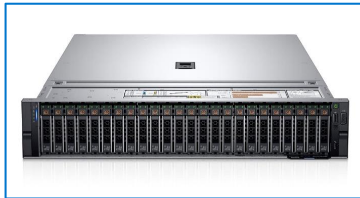
Figure 2 - R7525 in 24 drive NVMe Configuration

The Dell Poweredge R7525 24 NVMe configuration takes advantage of the above configuration. All 24 x4 NVMe drives are directly connected to the CPUs using up 96 of the available 160 lanes. This ensures that none of the NVMe drives have any oversubscription. All NVMe drives are directly connected maximizing throughput and reducing latency. The high core count of the 2 nd Gen AMD EPYC 7002 series also helps take advantage of this available lanes. The remaining 64 PCIe lanes are split up across 2 x16 slots, 1 x16 OCP 3.0 slot and 2 x8 slots that can be used for other peripherals like network cards.