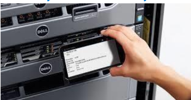
Figure 1 An administrator using iDRAC Quick Sync

Quick Sync bezels are available on selected 13th generation PowerEdge servers equipped with a Quick Sync bezel. OMM Android uses Near-Field Communication (NFC) technology to communicate with the Quick Sync bezel which is secured using encryption and authentication.