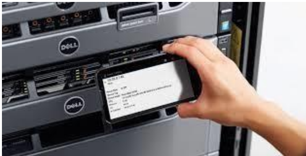
Figure 1 An administrator using iDRAC Quick Sync selected for use in mobile payment solutions.

Quick Sync bezels are available on selected 13 th generation PowerEdge servers equipped with a Quick Sync bezel. OMM Android uses Near-Field Communication (NFC) technology to communicate with the Quick Sync bezel.