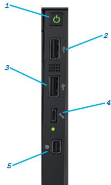
Figure 2 – Right Control Panel

The power button on the right control panel provides chassis power status and chassis power control. When the LED of the power button is lit green, the chassis power state is ON. If not lit, the state is OFF.