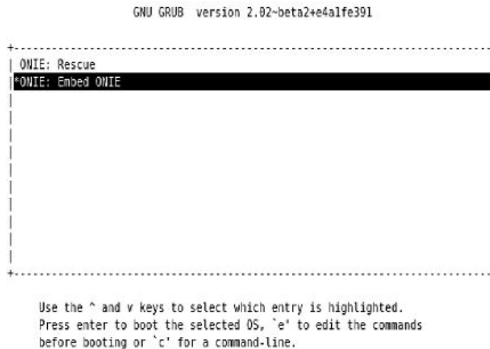
Figure 3. Embed ONIE menu

After the system exits the BIOS Boot menu, the system boots with the ONIE USB and presents the following menu: