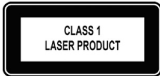
Figure 1. Class 1 laser product tag