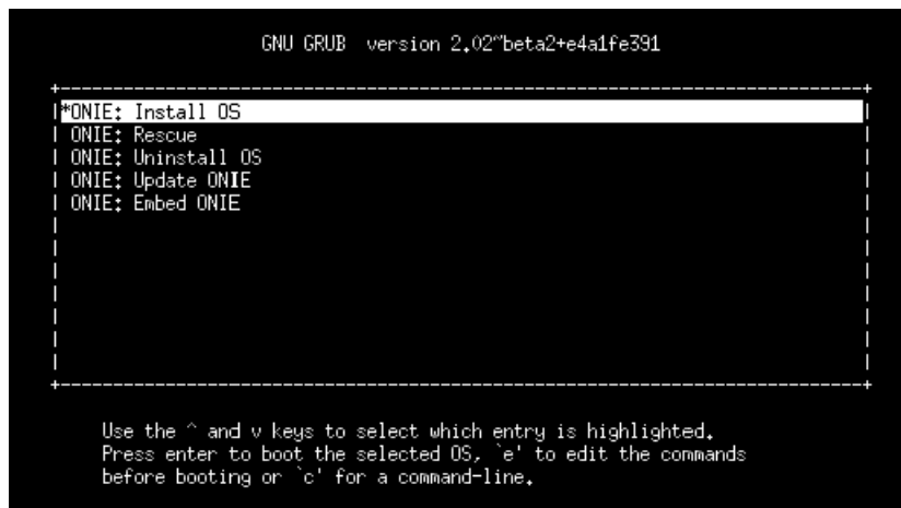
Figure 4. ONIE install menu

The system comes up in ONIE Install mode by default, as shown: