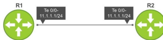
Figure 2. BGP Topology

The following are the sample BGP configurations via REST API.